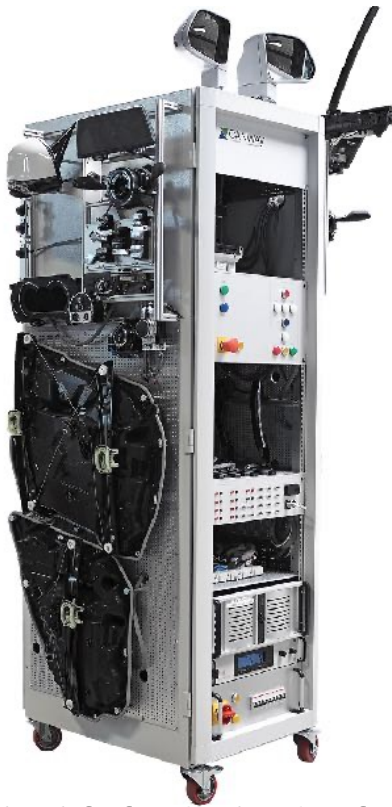
Test bench for functional testing of exterior components and door modules