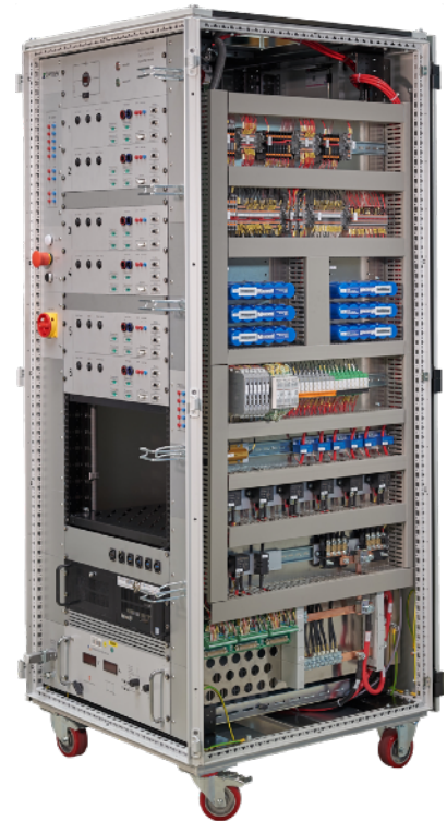
Environmental test platform for automated hardware releases of up to six electromechanical DUTs