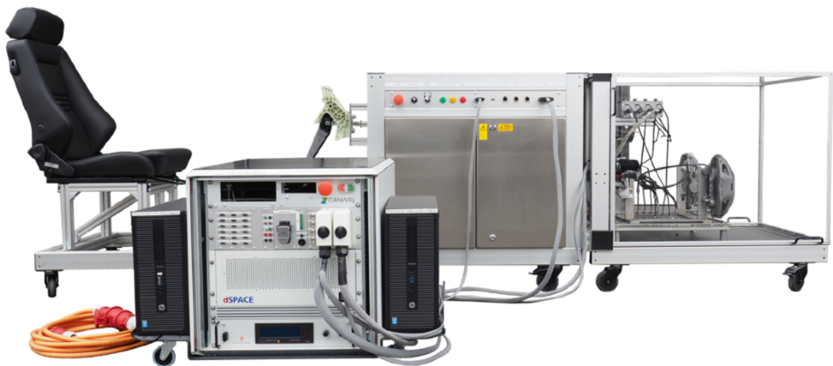
Test bench for functional testing of brake systems with computer-aided control of way, speed and force