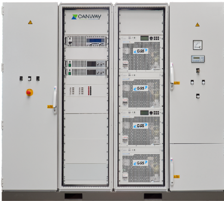
System for controlling a test bench for functional testing of battery management systems