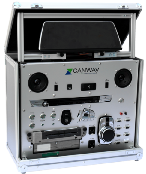
Infotainment test bench for testing and securing the connection of smartphones to the vehicle infotainment system