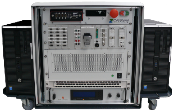
Component HiL for the release of hardware and software of an ECU